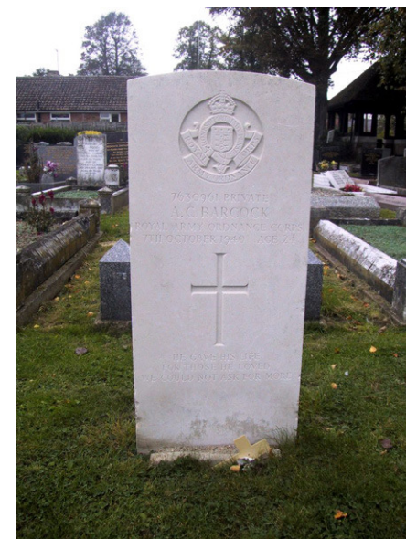
CWWG headstone in Olney Cemetery

In daylight, at about five o'clock in the afternoon, the first of 300 German bombers began dropping incendiary bombs on the East End of London. The docks areas of West Ham and Bermondsey, and adjoining Poplar, Shoreditch, Whitechapel and Stepney were particularly hard hit. As darkness fell the light of the fires guided other bombers to their target and bombs fell constantly throughout the night until about 4.30 the next morning. In this first raid 430 people were killed with 16,000 seriously injured. The blitz on London and the South continued for 76 consecutive nights (with the exception of 2nd November), and by New Years Day 1941 13,339 people had been killed as a result.